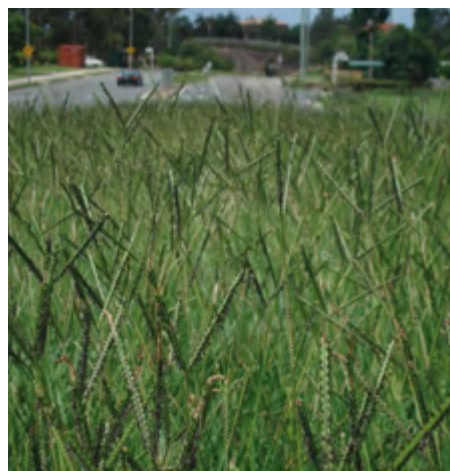
Bahia Grass Seedheads

MONUMENT LIQUID can be used as a post-emergent herbicide on the following warm season turf species: