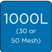
NOZZLE COLOUR FOR OPTIMUM WATER RATE

Applications of SIMPLOT DROPZONE: INJECTABLE to irrigation water commences a series of reactions in both the water and the soil where the treated water is applied. Firstly the pH of water containing bicarbonates will be reduced, forcing carbon dioxide out of the water. This will eliminate bicarbonates and increase calcium availability and improve soil structure. The overall benefit to soil chemistry and nutrient efficiency is pronounced.