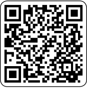
MSDS QR CODE

SIMPLOT DROPZONE: INJECTABLE contains a blend of organic acids and nutrients essential for bicarbonate removal and soil recovery.