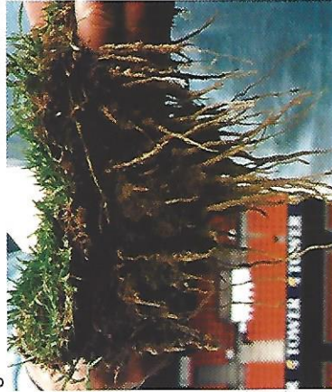
Enhanced root growth after turf establishment with Trichoprotection

Trichoflow Turf Plus is a cost-effective biological inoculant treatment developed for your valuable fine sports turf. Trichoflow Turf Plus contains proprietary strains of the beneficial fungus Trichoderma , especially formulated to support penetrates, colonises and protects the turf root zone roots of turf where they act as a living barrier to promote niche exclusion of other microbes. Establishment of Agrimm's unique strains of Trichoderma amongst turf roots minimises excessive build up of the thatch layer and assists healthy root growth.