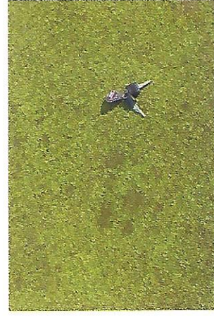
Unhealthy patches on untreated half of green (top image) compared with healthy turf on treated half of green (bottom image)

After application it is recommended that light irrigation be applied.