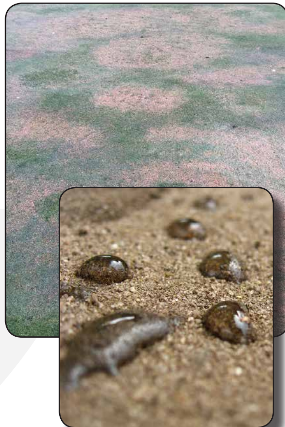
Water repellency on a hydrophobic soil leads to the development of localized dry spot (LDS) in established turfgrasses