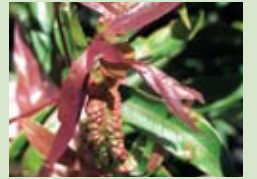
Psyllids on a lillypilly