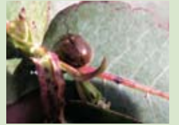
Chrysomelid beetle on a eucalypt leaf