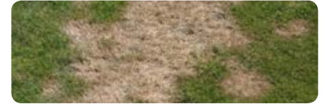
Seedling Damping Off ( Pythium spp.)