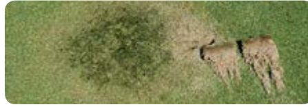
Pythium Root Rot